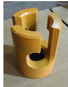
3 J HOOK